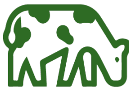
Innovative Farming Models